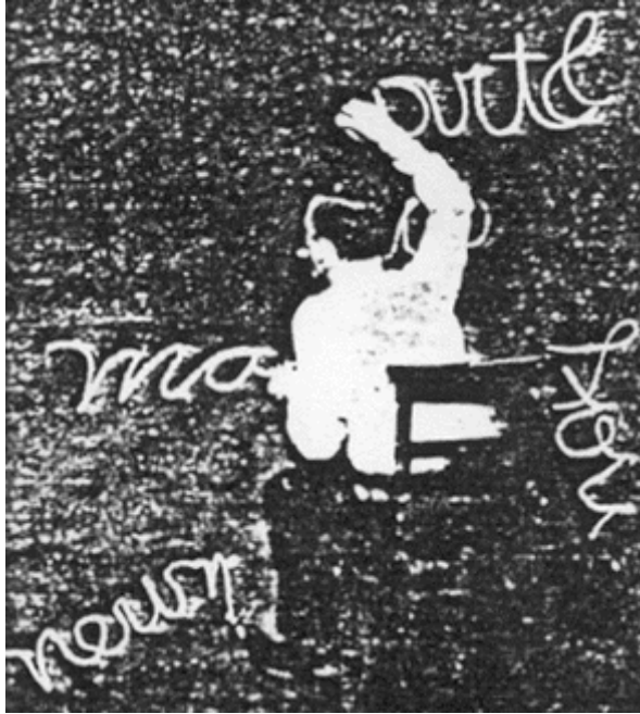
Figure 4: Solving A Crossword Puzzle While Suspended Head Downwards ~ Mr Kahne recently performed this feat in response to a challenge, and completed the puzzle correctly in 13 minutes.