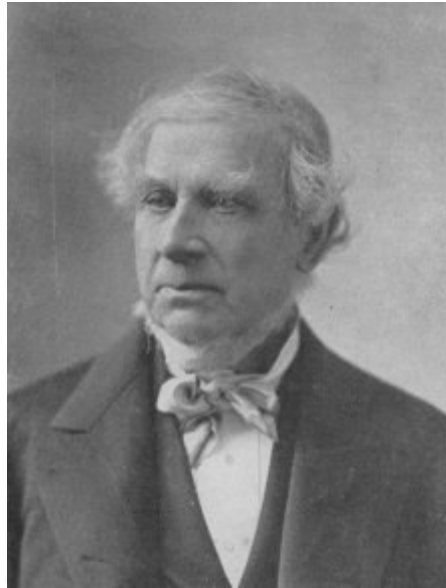
THURLOW WEED, American Journalist and Politician. b. Cairo, N.Y., 1797; d. New York, 1882.

Ben Jonson, when following his trade of a mason, worked on Lincoln's Inn in London with trowel in hand and a book in his pocket. Joseph Hunter was a carpenter in youth, Robert Burns a plowman, Keats a druggist, Thomas Carlyle and Hugh Miller masons. Dante and Descartes were soldiers. Cardinal Wolsey, Defoe, and Kirke White were butchers' sons. Faraday was the son of a hostler, and his teacher, Humphry Davy, was an apprentice to an apothecary. Kepler was a waiter boy in a German hotel, Bunyan a tinker, Copernicus the son of a Polish baker. They rose by being greater than their callings, as Arkwright rose above mere barbering, Bunyan above tinkering, Wilson above shoemaking, Lincoln above rail-splitting, and Grant above tanning. By being first-class barbers, tinkers, shoemakers, rail-splitters, tanners, they acquired the power which enabled them to become great inventors, authors, statesmen, generals. John Kay, the inventor of the fly-shuttle, James Hargreaves, who introduced the spinning-jenny, and Samuel Compton, who originated mule-spinning, were all artisans, uneducated and poor, but were endowed with natural faculties which enabled them to make a more enduring impression upon the world than anything that could have been done by the mere power of scholarship or wealth.