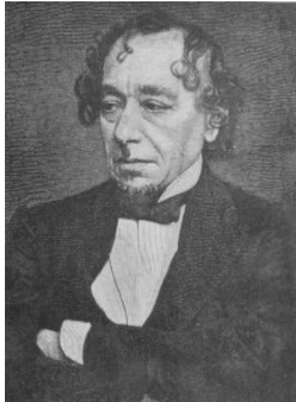
BENJAMIN DISRAELI (Earl of Beaconsfield), English Statesman and Novelist. b. London, 1804; d. London, 1881.

"Every condition, be it what it may," says Channing, "has hardships, hazards, pains. We try to escape them; we pine for a sheltered lot, for a smooth path, for cheering friends, and unbroken success. But Providence ordains storms, disasters, hostilities, sufferings; and the great question whether we shall live to any purpose or not, whether we shall grow strong in mind and heart, or be weak and pitiable, depends on nothing so much as on our use of the adverse circumstances. Outward evils are designed to school our passions, and to rouse our faculties and virtues into intenser action. Sometimes they seem to create new powers. Difficulty is the element, and resistance the true work of man. Self-culture never goes on so fast as when embarrassed circumstances, the opposition of men or the elements, unexpected changes of the times, or other forms of suffering, instead of disheartening, throw us on our inward resources, turn us for strength to God, clear up to us the great purpose of life, and inspire calm resolution. No greatness or goodness is worth much, unless tried in these fires."